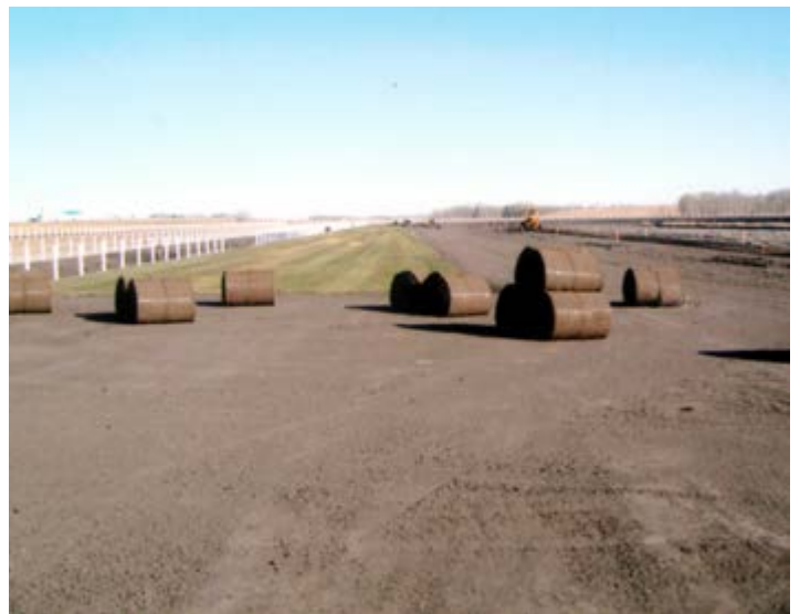
ALL-WEATHER SAWDUST TRACK