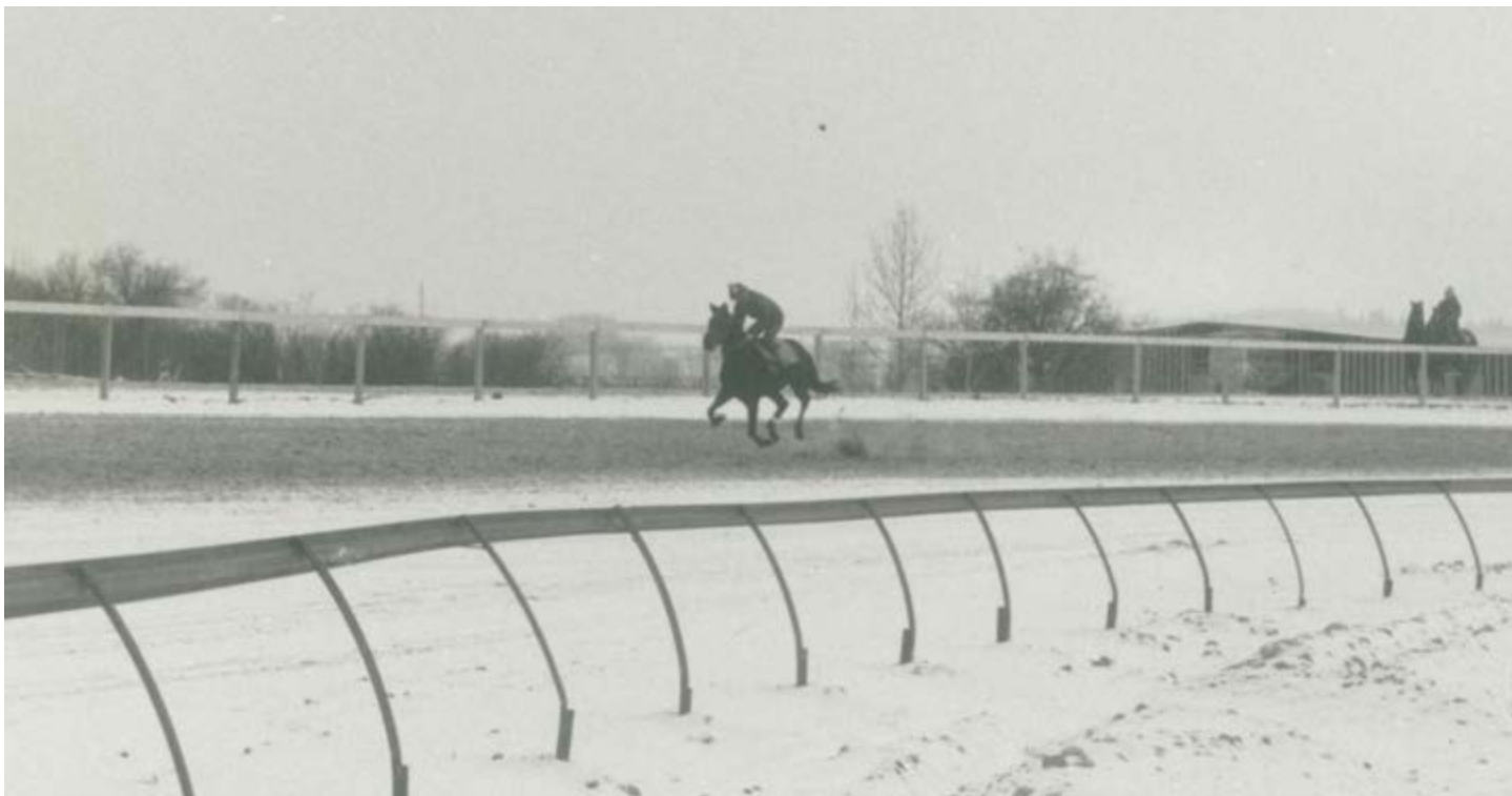
SAWDUST SURFACE NEVER FREEZES