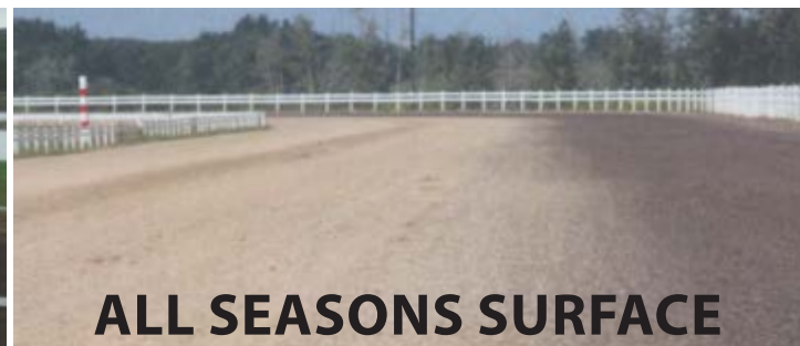
ALL SEASONS SURFACE