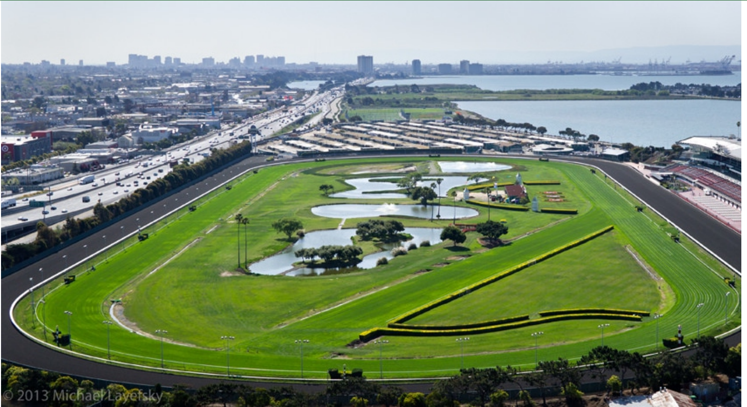
GOLDEN GATE FIELDS