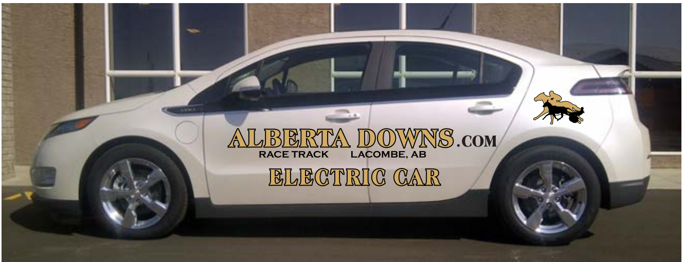
Electric car hook-ups to reduce fuel consumption to and from the track