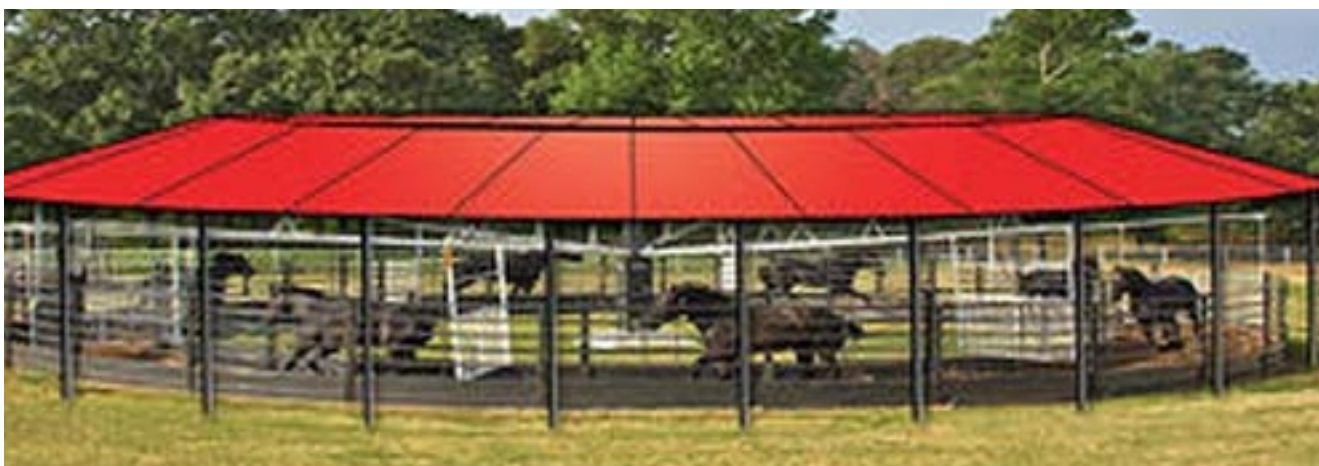
Large circumference hot walkers