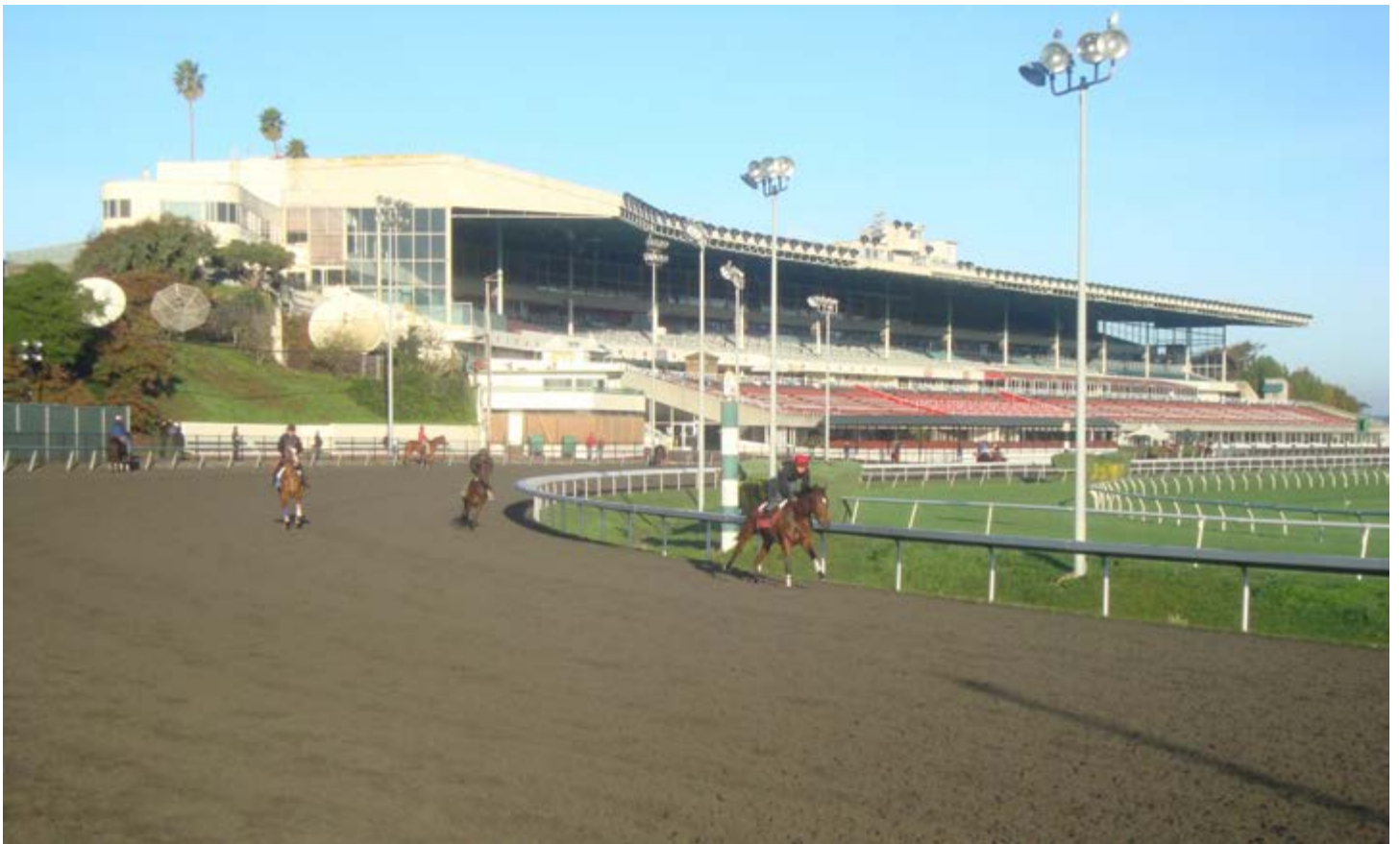
EXTREMELY SAFE TAPETA ALL-WEATHER SURFACE