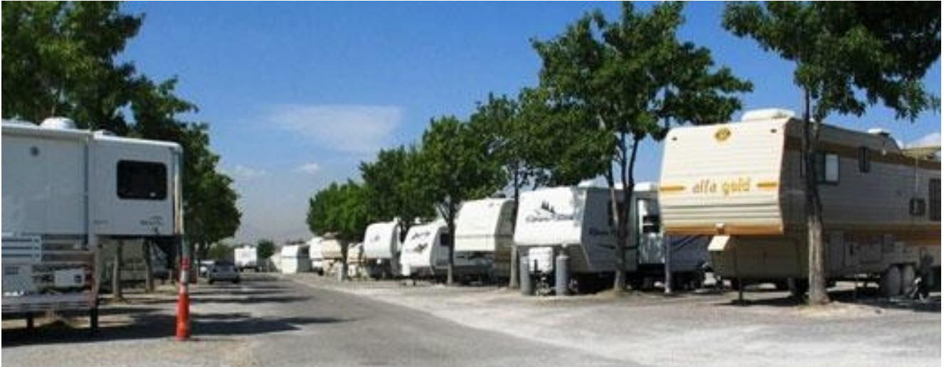
Affordable housing for horsemen and tourists