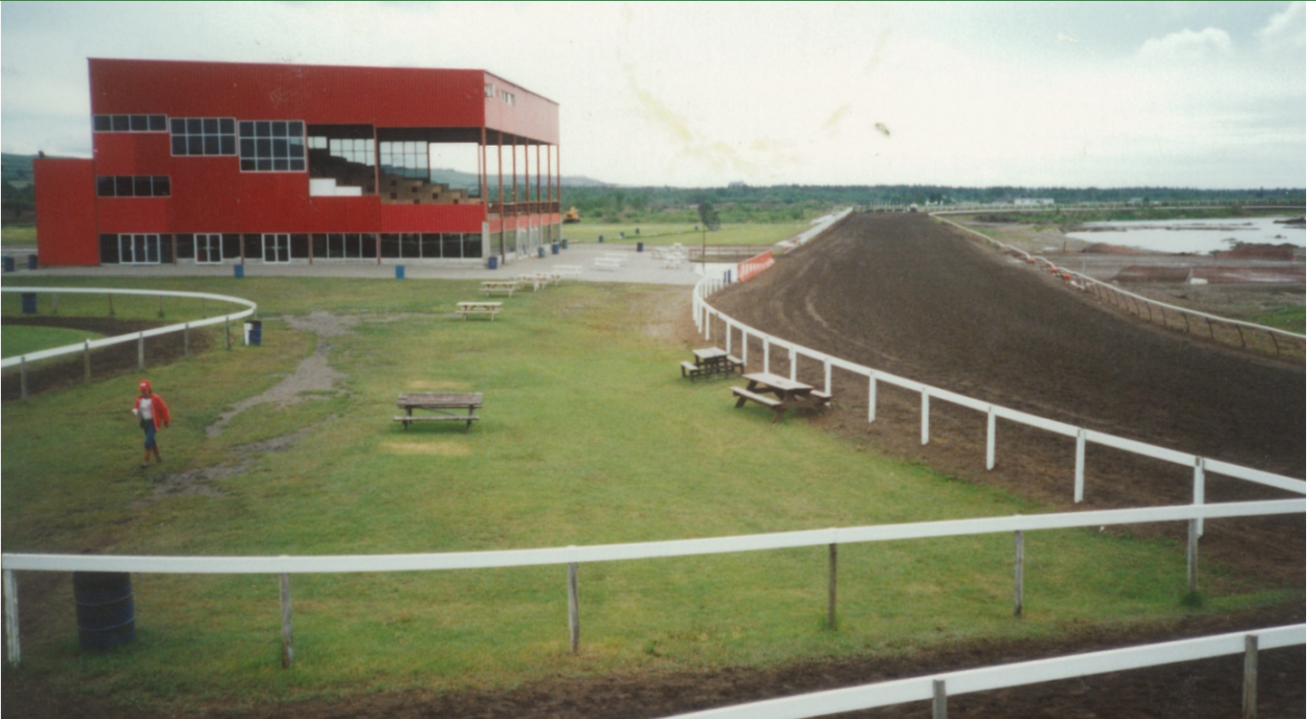
ALL-WEATHER SAFETY TRACK