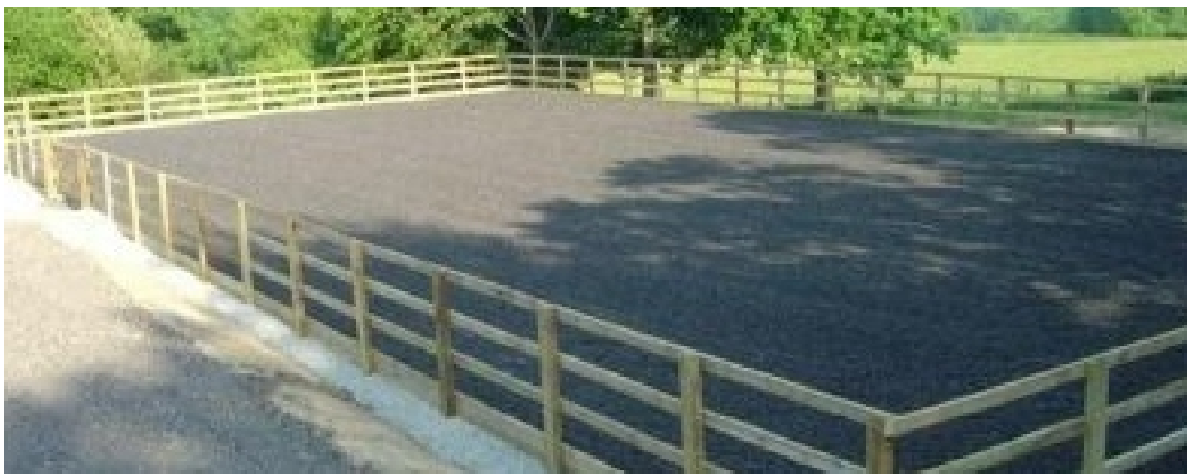
Turn out paddocks for race horses