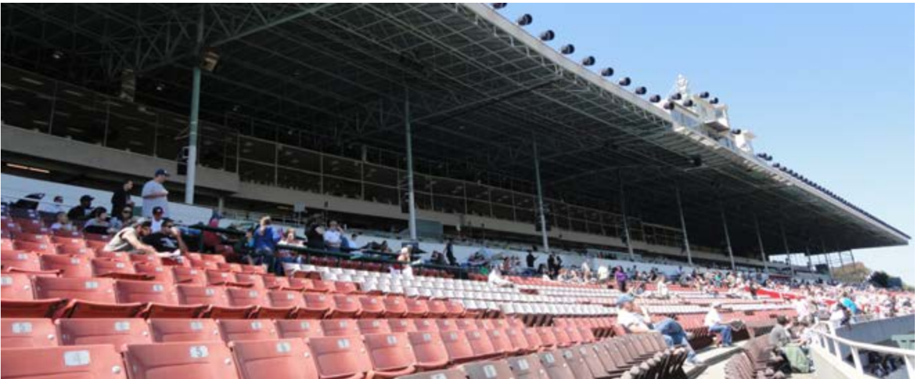
Most grandstands have large capacities for events